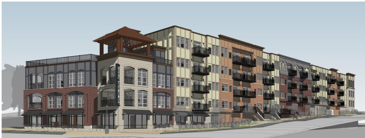
1 EXTERIOR FROM NORTHWEST