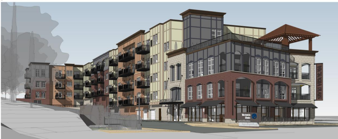
2 EXTERIOR FROM NORTHEAST