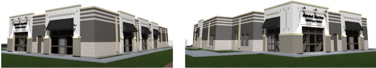
ABOVE: Preliminary renderings of the proposed daycare building design. Please note the above is for general reference only – some details of the above building design have not been finalized; however, updated information will be provided at the public hearing.